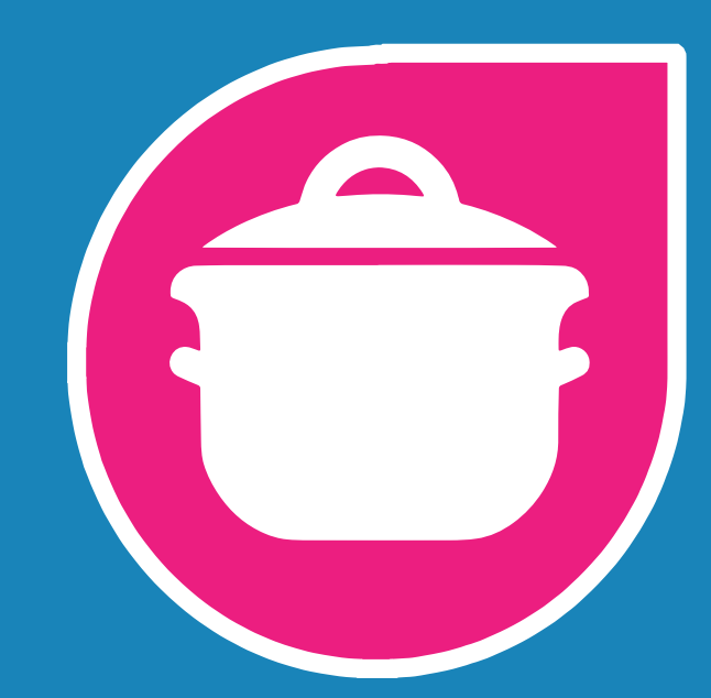
2 LITRES FOR COOKING