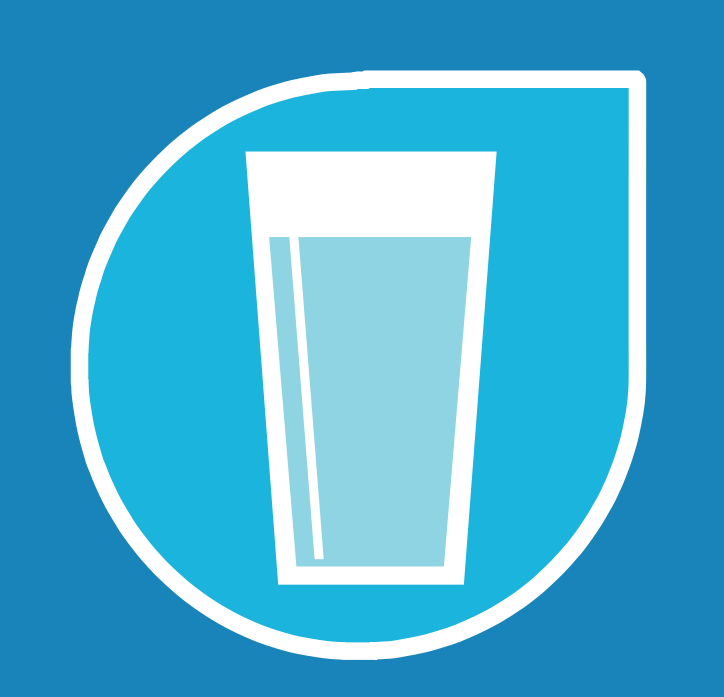
2 LITRES OF DRINKING WATER