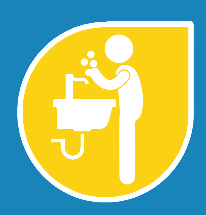
2 LITRES FOR DAILY HYGIENE