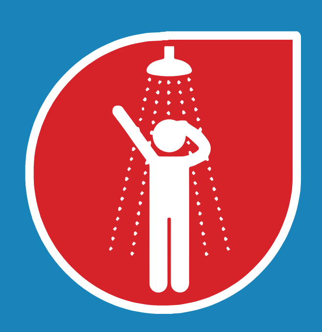
15 LITRES FOR A 90 SEC SHOWER